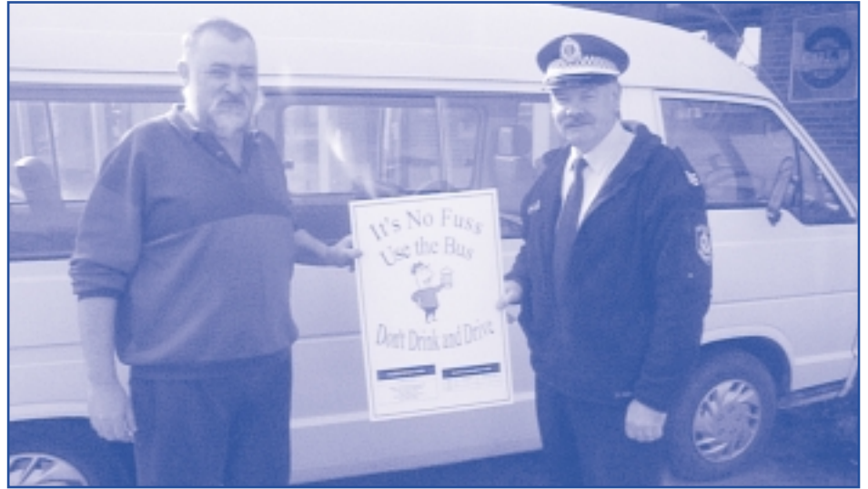
“It’s No Fuss - Use the Bus”

Residents and visitors to the area have found that using the map to plan their journey reduces the frustration felt when they are