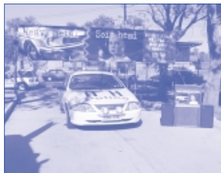
Launch of SSRoC Heavy Metal Soft Head Project

Following the previous successes of the earlier stages of the campaign, this phase reaches its target audience via media (bus backs and youth media advertising) and a range of youth-friendly resources that include mouse mats, posters, bookmarks, folder index dividers, cups and posters. These will be distributed via project partners throughout the 11 member council areas, ensuring that the message Speed Kills People - Kill Your Speed reaches its target audience from a range of angles.