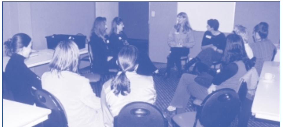
A group discusses issues relating to females and drink driving

Discussion group participants did note the