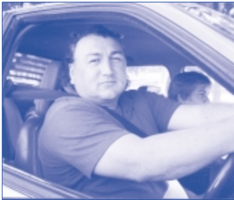
A local driver supports the Moree Yallaroi Buckle Up Campaign

Observational surveys conducted in early May, prior to the campaign, revealed that around 86% of people were using restraints. Surveys conducted at the end of June showed that this figure had jumped to almost 95%.