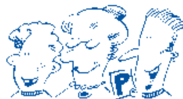
Safe Happy Community