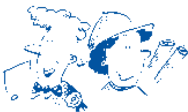
Council Road Safety Champions