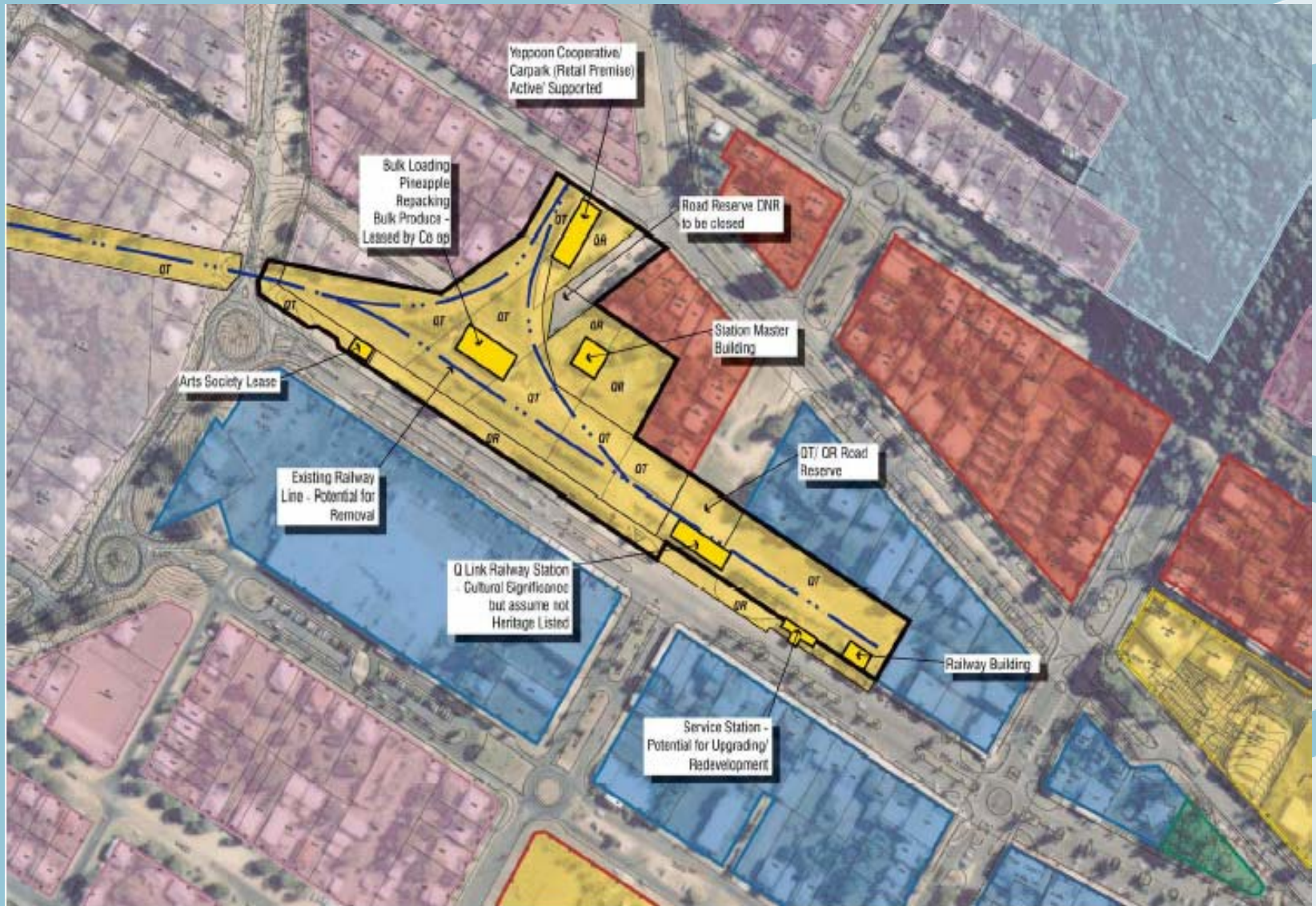
Figure 4 - Current Land Ownership/ Control