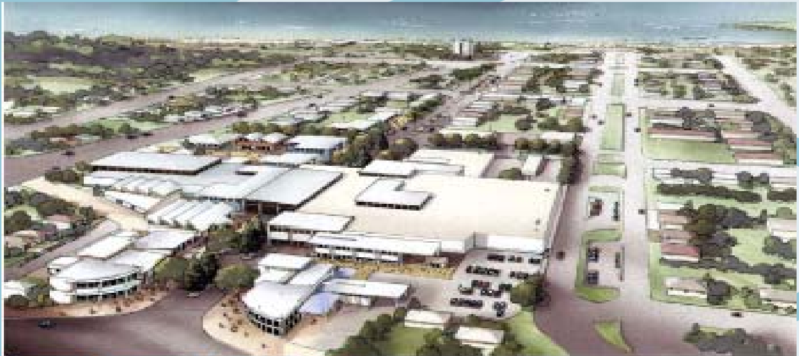
Yeppoon Commercial Precinct - Option 2

submission to queensland state government . july 2003